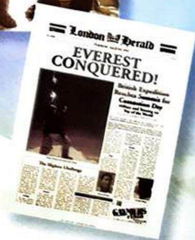
Tenzing at top of Mt. Everest Tenzing Norgay and Edmund Hillary & the News of the first climb, published in London Herald.