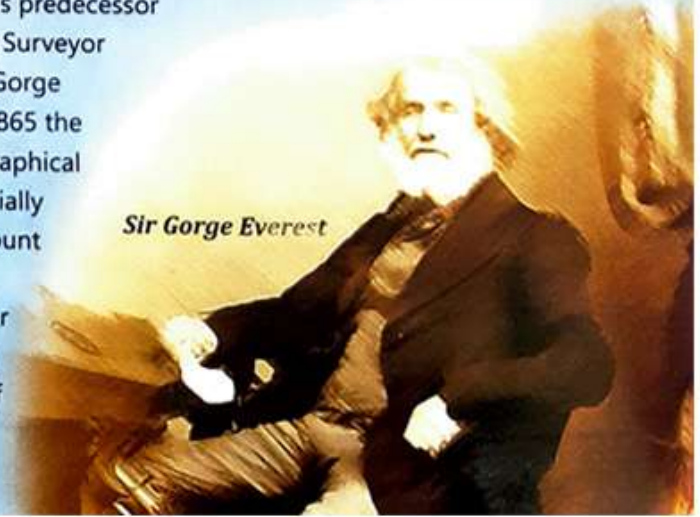
Sir Gorge Everest

1856: Andrew Waugh, the then Surveyor General of India announced the altitude of Everest as 29,202ft and suggested the name of the peak after his predecessor and the first Surveyor General Sir Gorge Everest. In 1865 the Royal Geographical Society officially adopted Mount Everest as the name for the highest mountain of the world.