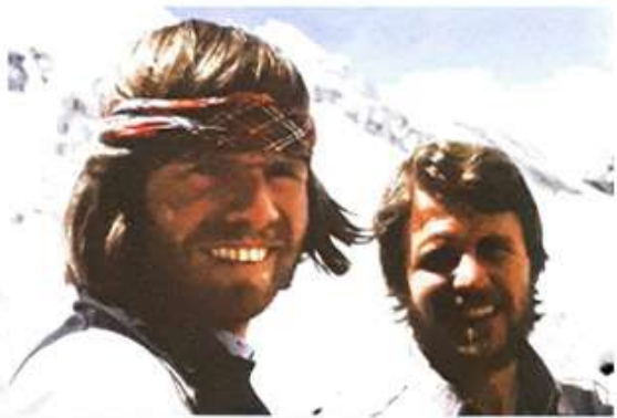
Reinhold Messner & Peter Habeler

1978: First ascent without supplemental oxygen by Reinhold Messner and Peter Habeler. Messner is the first mountaineer to solo climb the peak after three years from the North side. Reinhold Messner is the first man to climb all 14 eight-thousanders (peaks over 8,000 metres) and without supplemental oxygen.